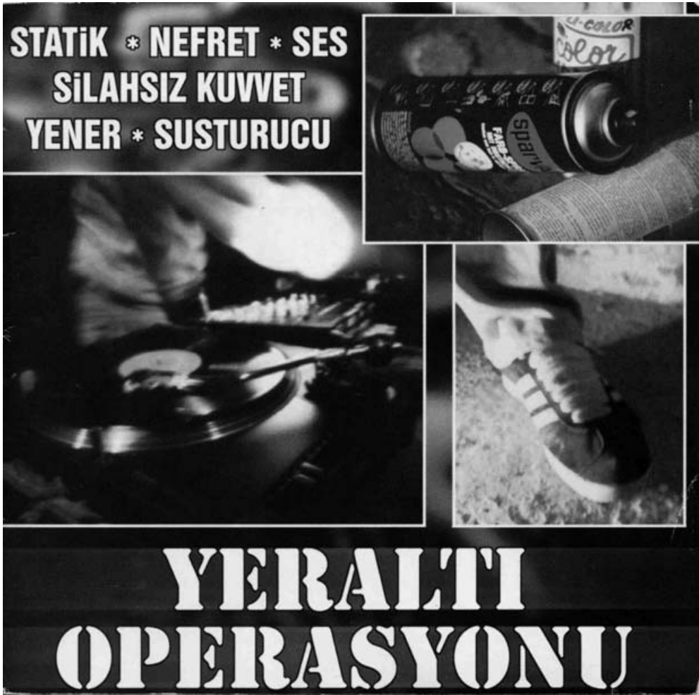
Figure 1. Front cover of the CD, Yeraltı Operasyonu.

ensuring record company acceptance and wider success for the potential album, it can also be interpreted as compromising some stylistic features of underground rap. And as part of an invitation to participate in an album with the word underground in the title, these stipulations seem surprising and not a little ironic.