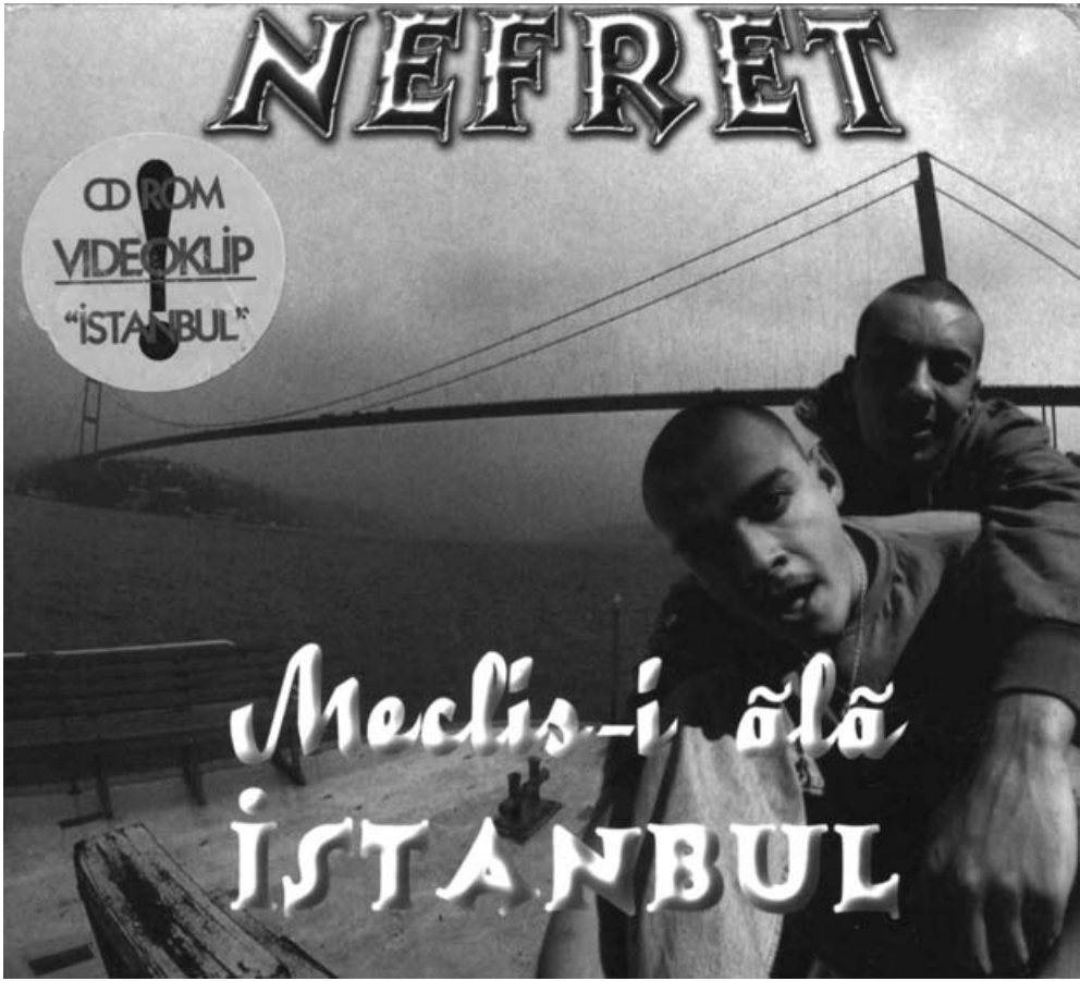
Figure 2. Front cover of Nefret's first album, Meclis-i Âlâ – İstanbul .

both in their early twenties. After having worked separately as solo rappers or in other groups, they founded Nefret in Istanbul in January 1998. After contributing to a collaboration between four groups on the 1998 single 'Vatan' and having four songs included on the 1999 Yeraltı Operasyonu compilation mentioned above, in 2000 they released their first full album, titled Meclis-i Âlâ – İstanbul ('High Council – Istanbul'). The album's cover photo (Figure 2) shows the two rappers beside the Bosphorus, with one of the two bridges spanning the strait in the background, thus unmistakably placing them within the geography of the city. A fold-out inlay card included with the CD contains the lyrics of all the songs printed over a four-panel panoramic view of the Bosphorus, looking over the strait toward the Asian side of the city.