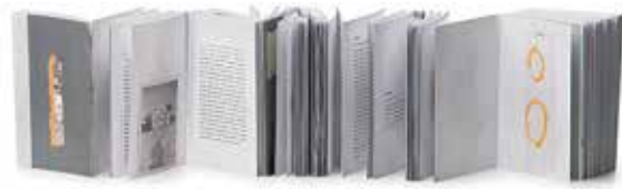
Fig. 2. By Anne Carson, from Nox, copyright © 2010 by Anne Carson. Reprinted by permission of New Directions Publishing Corp.

printed and published, made available for mass production and circulation. Despite its ambition of immediacy, the work also highlights this fact. While the original scrapbook was a codex (as indicated by reproduced marks of stitches from the sewing in the back), the reproduced replica is published in a leporello-format: it is folded like an accordion (see Fig. 2). Unfolded, it consists of one long piece of paper – 25 meters in total – where the fragments of texts and images are displayed side by side while the other side remains blank. In this way, the work challenges a conventional understanding of the book as a bound codex while also pointing back into the history of the book, to a time before the codex when words were scratched into monuments or written by hand on scrolls or tablets – or in folded books. 11