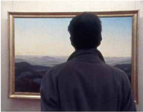
Persistence (Daniel Eisenberg, 1997). Courtesy of the artist.

condition, as a token of the impossibility of transgression and the insurmountable gap between generations.