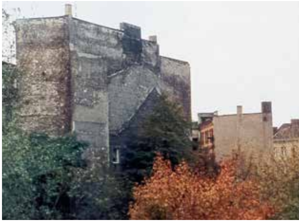
Persistence (Daniel Eisenberg, 1997). Courtesy of the artist.

Through its persistence of vision, the film seeks to crystallize the past and the present into a single spatial configuration. In the multiple temporal registers superimposed over the course of the film, like the images of the Elisabethkirche which appears first as a picturesque ruin and later as a construction site, time appears to be moving in several, and sometimes opposite, directions. This method further entails a process of sifting through strata of gazes, exploring its various layers as well as the gaps between them. As Eisenberg has remarked, an image not only documents “what is seen, but a way of seeing” (Eisenberg 1997). To remember is thus to enter a field of crossing sightlines. Questioning each image by introducing yet another point of view, Persistence brings a host of conflicting vantage points to bear on the collapse of the Eastern block and the disintegration of the GDR. The theme is introduced with the conflation of the elevated viewpoint of the Roman goddess in Tiergarten and Benjamin’s angel. It is followed, in turn, by the airborne view of the Signal Corps, the prospect of Ruinenberg set up by Frederick the Great; the