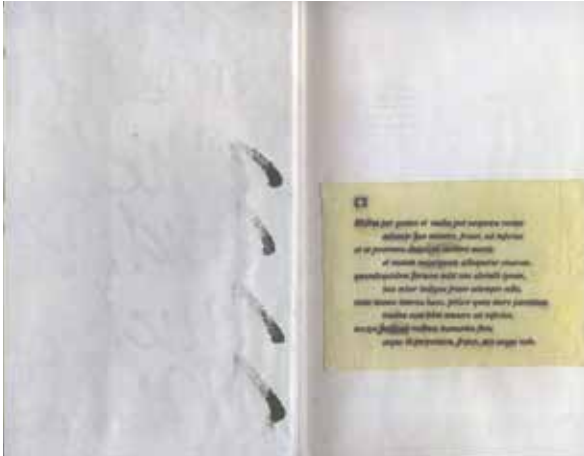
Fig. 3. Poem from Nox. By Anne Carson, from Nox, copyright © 2010 by Anne Carson. Reprinted by permission of New Directions Publishing Corp.

thus seems to complicate the process of translating the past into the present. The poem makes evident the passing of time, although this physical decay is again an illusion. Carson has explained that the paper only looks old and yellowing because it was soaked in tea (Teicher; see Fig. 3).