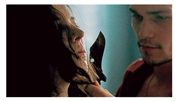
Illustration 1. Boyan cutting Mélania's hair in La Vie nouvelle. Directed by Philippe Grandrieux and produced by Mandrake Films.

Furthermore, the intense gaze of Seymour ensues as he watches Mélania dance in the scene that follows.<sup>5</sup> These closeups, and those of La Vie nouvelle in general, are examples of that which Deleuze in Cinéma 1 – L'Image-mouvement calls the affection-image . In conventional, narrative film, the close-up most often functions as action-image because it is made operative in a certain "state of things" ( état de choses ), which "includes a determinate space-time, spatio-temporal coordinates, objects and people, real connections between all these givens. In a state of things which actualises them [...] affects become sensation, sentiment, emotion or even impulse [ pulsion ] in a person, the face becomes the character or mask of the person" (Deleuze 2009: 100).