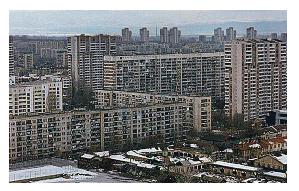
Illustration 4. Bleak cityscape in La Vie nouvelle. Directed by Philippe Grandrieux and produced by Mandrake Films.

dominated by the straight angles of uniform, concrete apartment buildings occupies the entire frame: