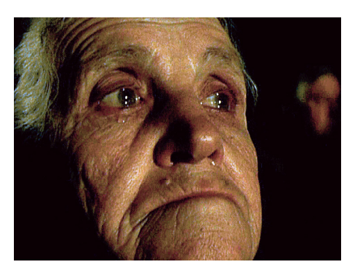
Illustration 2. Close-up of old woman in La Vie nouvelle. Directed by Philippe Grandrieux and produced by Mandrake Films.

group, which comes to a relative rest in a clearly focused, half-profile close-up of a middle-aged woman whose dark eyes stare straight ahead. After a few seconds the movement is repeated, this time closing in on the face of another woman. A third approach ends in a close-up of the wrinkled face of a white-haired, elderly woman, followed by an ultra closeup highlighting a teardrop beneath her eye, while the eerie, rumbling sound intensifies: